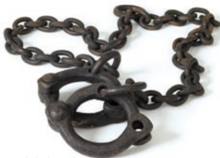
Convict leg irons and Fremantle Prison Collection

John Boyle O'Reilly, Moondyne Joe: A Story from the Underworld , 1878