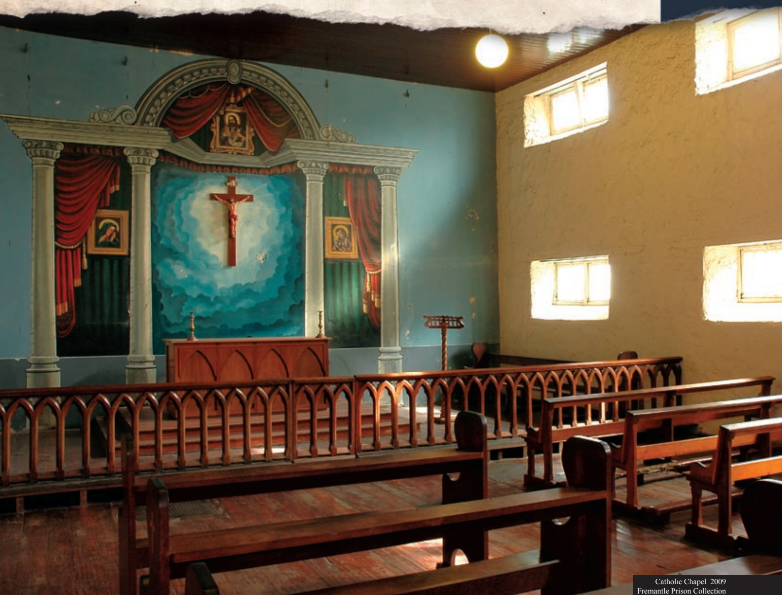
Catholic Chapel 2009