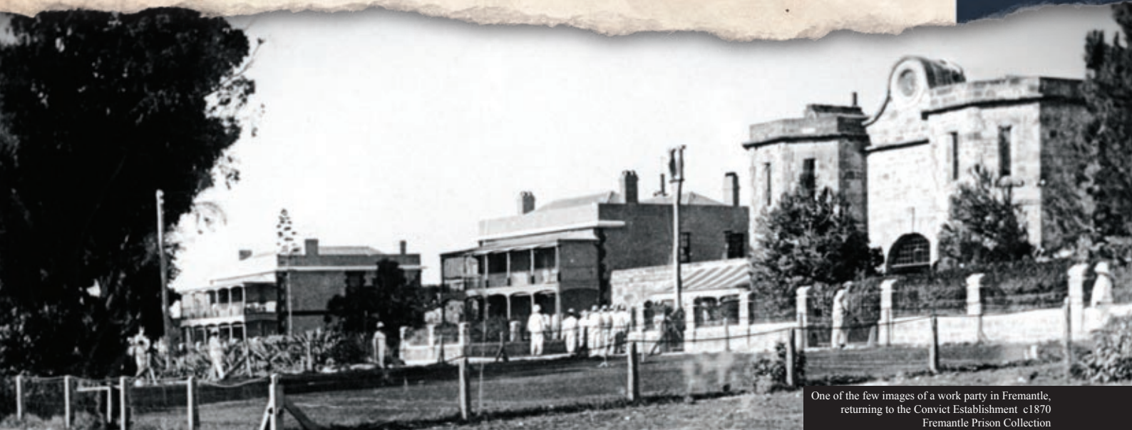
One of the few images of a work party in Fremantle, returning to the Convict Establishment c1870

A work party or chain gang was a party of convicts assigned to hard labour in chains. Convict work parties were used to build public works and buildings throughout the colony. Work parties worked up to ten hours a day, each convict linked to his companions by a long length of chain. Residents of Fremantle during the 1850s and 1860s would have been very familiar with the early morning sound of jangling chains as work parties made their way through the streets to the various construction sites.