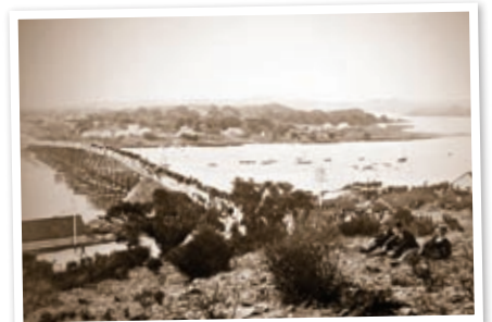
The North Fremantle Bridge c1870s

The bridge itself was 954 feet long and 2078 feet with the approaches. 6 At the midpoint it was 42 feet above the water to allow for the passage of boats. On its completion the Clerk of Works, James Manning, arranged for the convicts who had worked on the bridge be given extra rations in appreciation for their work. Improvements immediately commenced on the northern road (later to be named Stirling Highway). Convicts used sawn sections of jarrah to strengthen the road's surface which were anecdotally referred to as Hampton's Cheeses.