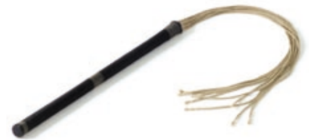
Cat o' nine tails and Fremantle Prison Collection

Convicts who broke the prison rules or who tried to escape were often flogged. Difficult convicts could be whipped up to 100 times. Flogging instruments included the cat o' nine tails, a whip with nine knotted strands or cords, and the birch, a bundle of long birch twigs bound together by cord. Flogging was a brutal punishment that caused extreme pain and physical scarring.