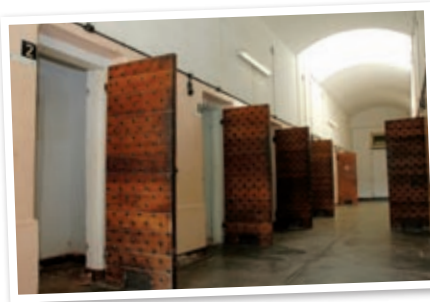
Refractory block 2006 Fremantle Prison Collection

Prisoners who attempted to escape were flogged and locked in solitary confinement on a diet of bread and water. There were 12 punishment cells and six windowless 'dark' cells. Each cell had double chambers with inner and outer doors for added security which also prevented communication between prisoners. The only things the convicts had for company were a toilet bucket, a bed without a mattress, a blanket and a bible.