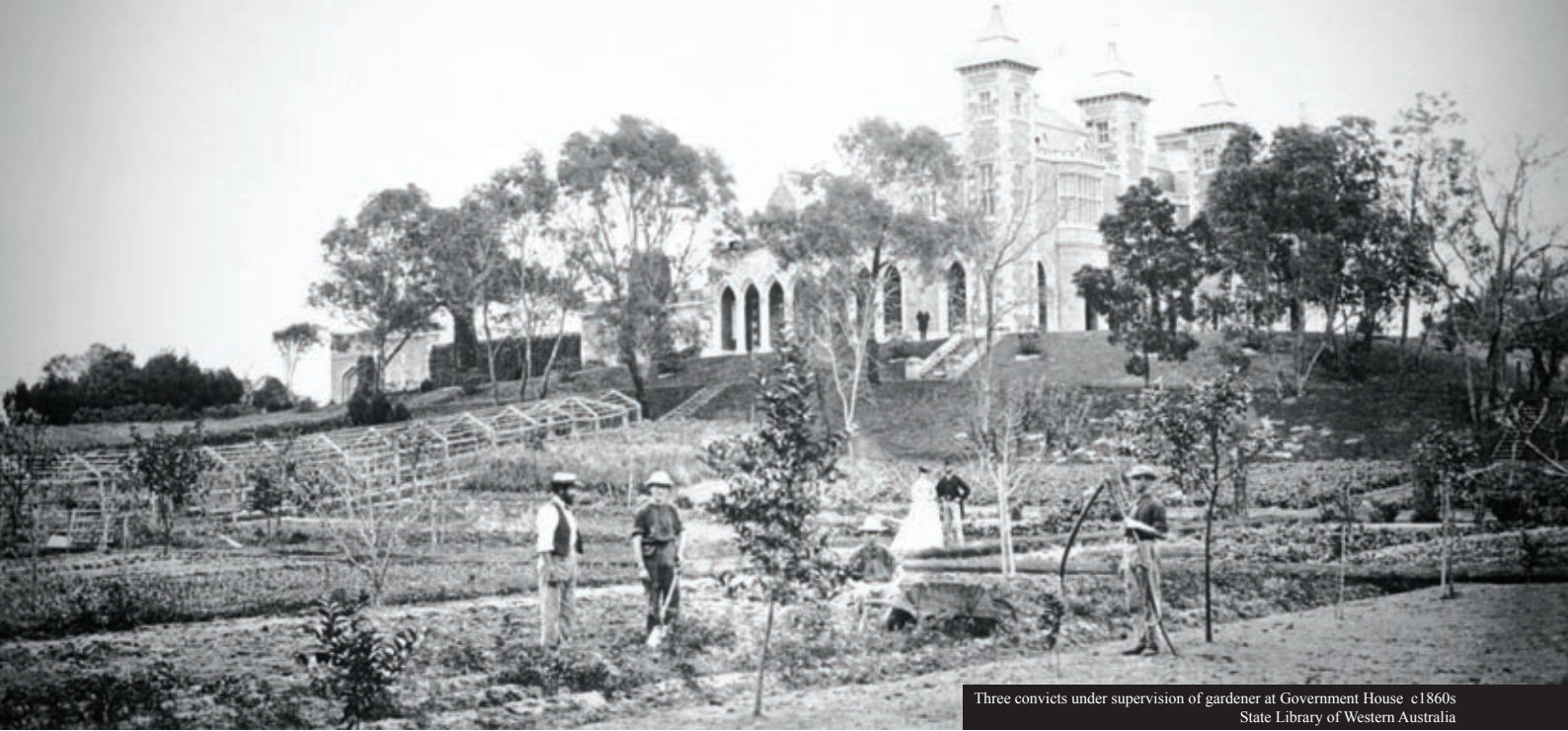
Three convicts under supervision of gardener at Government House c1860s