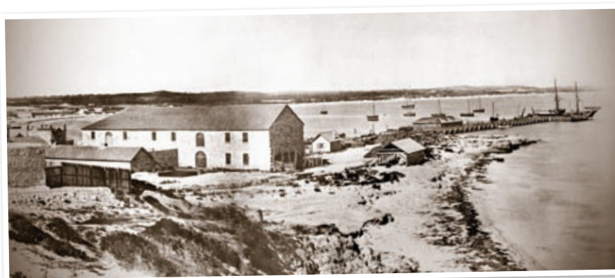
South Bay Jetty c1870