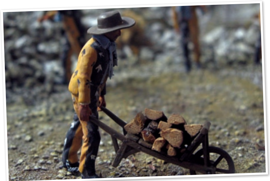
Detail of a diorama showing the convict uniform Fremantle Prison Collection