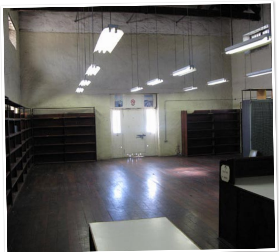
Fremantle Prison library, originally the southern upper Association Ward 2009

Convicts slept in hammocks that were folded away each morning. Each ward had a large wooden tub that served as a communal toilet. The convicts had to carefully carry these tubs outside daily to be emptied and cleaned. Each of the wards held up to 60 men.