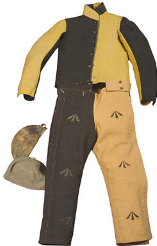
Particoloured convict uniform

Convict uniforms were stamped or stencilled with the broad arrow mark, a symbol dating back to the 17th century that featured on all British Government property. A black arrow was marked on light fabrics and a white or yellow arrow marked on dark fabrics. Because of their poor quality, few of these uniforms have survived. Fremantle Prison has three jackets (two particoloured and one plain), one flannel short sleeved shirt and the remnants of a belt in its collection.