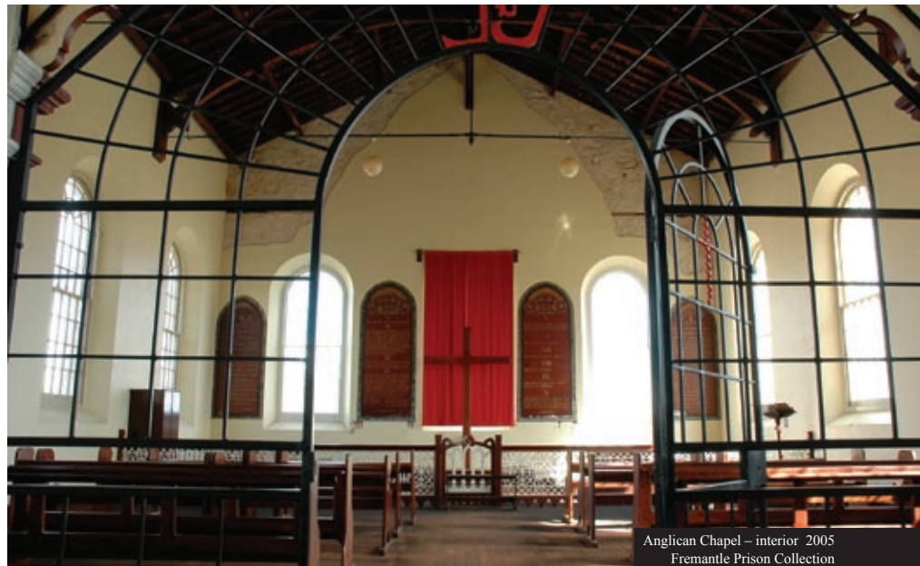
Anglican Chapel – interior 2005

Apart from these duties, during the first decade the chaplain also had to oversee the construction of the Anglican Chapel.