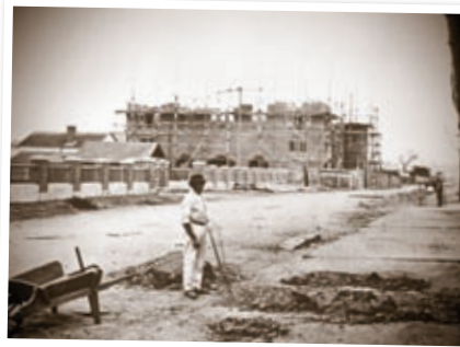
Convict working on road during construction of the Perth Town Hall c1868

The Perth Town Hall is the only convict-built town hall in Australia. The tower is 120 feet high and decorated with a number of convict motifs, including windows in the shape of the broad arrow and decorations in the shape of a hangman's rope.