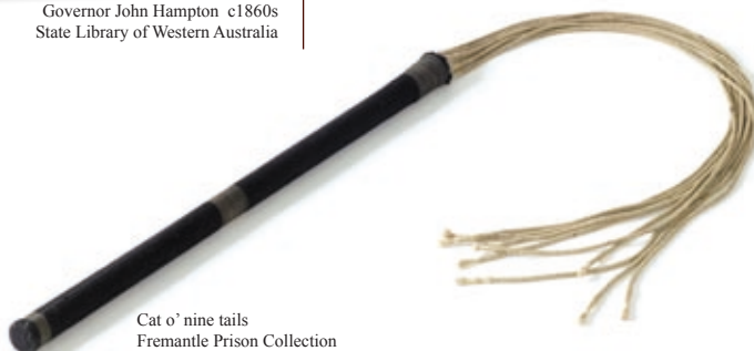
Cat o' nine tails Fremantle Prison Collection

Under the management of the Hamptons, escape attempts increased. Between June 1866 and March 1867, more than 90 convicts attempted to escape – three times the number of any other nine-month period. 5 Of the 32 floggings during 1864, 25 were for escape attempts. Similarly, during 1865, 23 of the 40 floggings were for escape attempts.