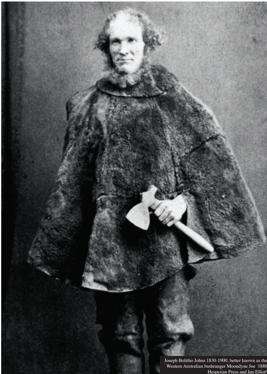
Joseph Bolitho Johns 1830-1900, better known as the Western Australian bushranger Moondyne Joe 1880