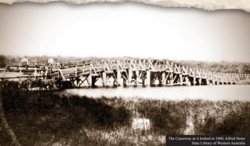
The Causeway as it looked in 1860, Alfred Stone State Library of Western Australia