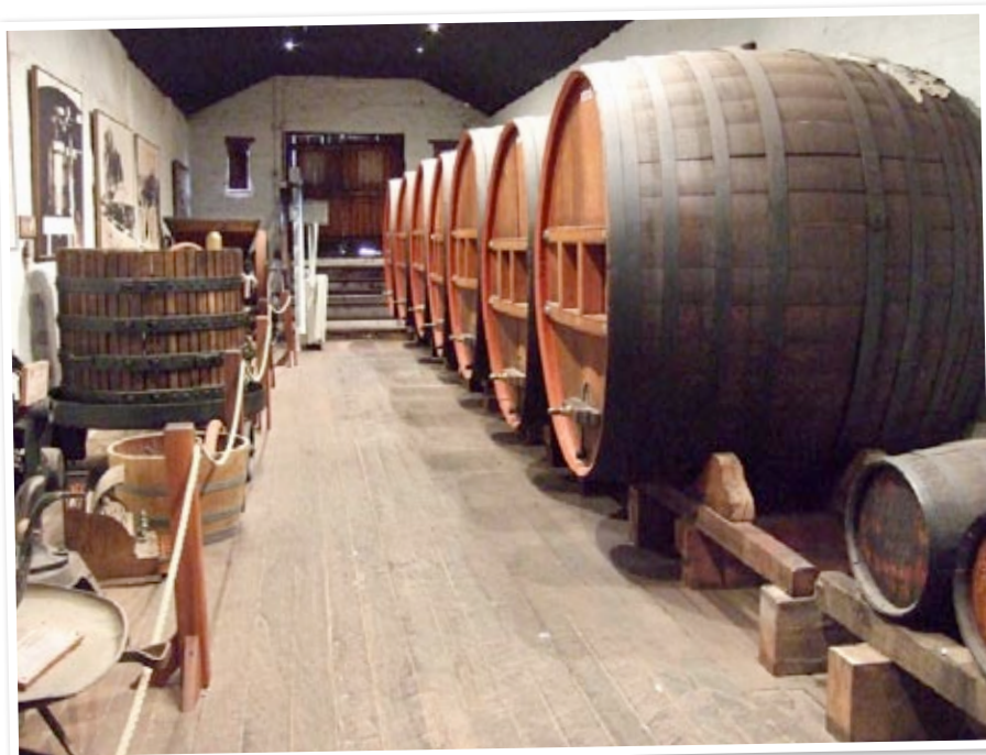
The cellar at Houghton's Winery, 2008

... we commenced to walk towards a cask of wine which was on tap. We had only gone a few yards from the door when there was an unearthly yell and the tall figure of a man, with hair streaming over his shoulders and looking extremely weird ... sprang out of the darkness. He ... dashed past us straight into the arms of the police officers and the other men who were following. ... I confess I was scared for the moment as, I think, most men would have been in similar circumstances, and was relieved when I got outside to find that my attacker had been captured by the police, and was sitting on the ground securely handcuffed. No one at first recognised the intruder; and then someone called out, "Why, its Moondyne." "Yes", replied the prisoner; "you have got me at last." 9