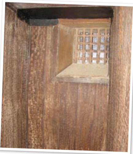
The 'escape-proof' cell, 2008