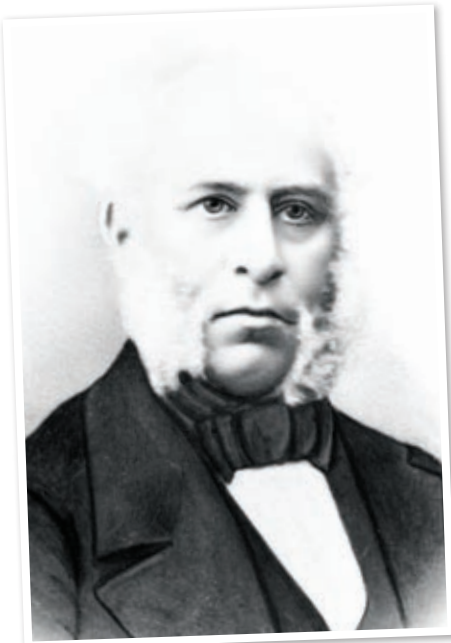
Governor John Hampton c1860s

John Hampton was appointed Governor of Western Australia on 28 February 1862. He had a controversial background – while employed as Comptroller-General of Convicts in Van Diemen's Land from 1846 to 1855 he was accused of corruption and making money from the illegal employment of convict labour. His governorship of the colony came to be one of the darkest periods for convicts in the prison's history.