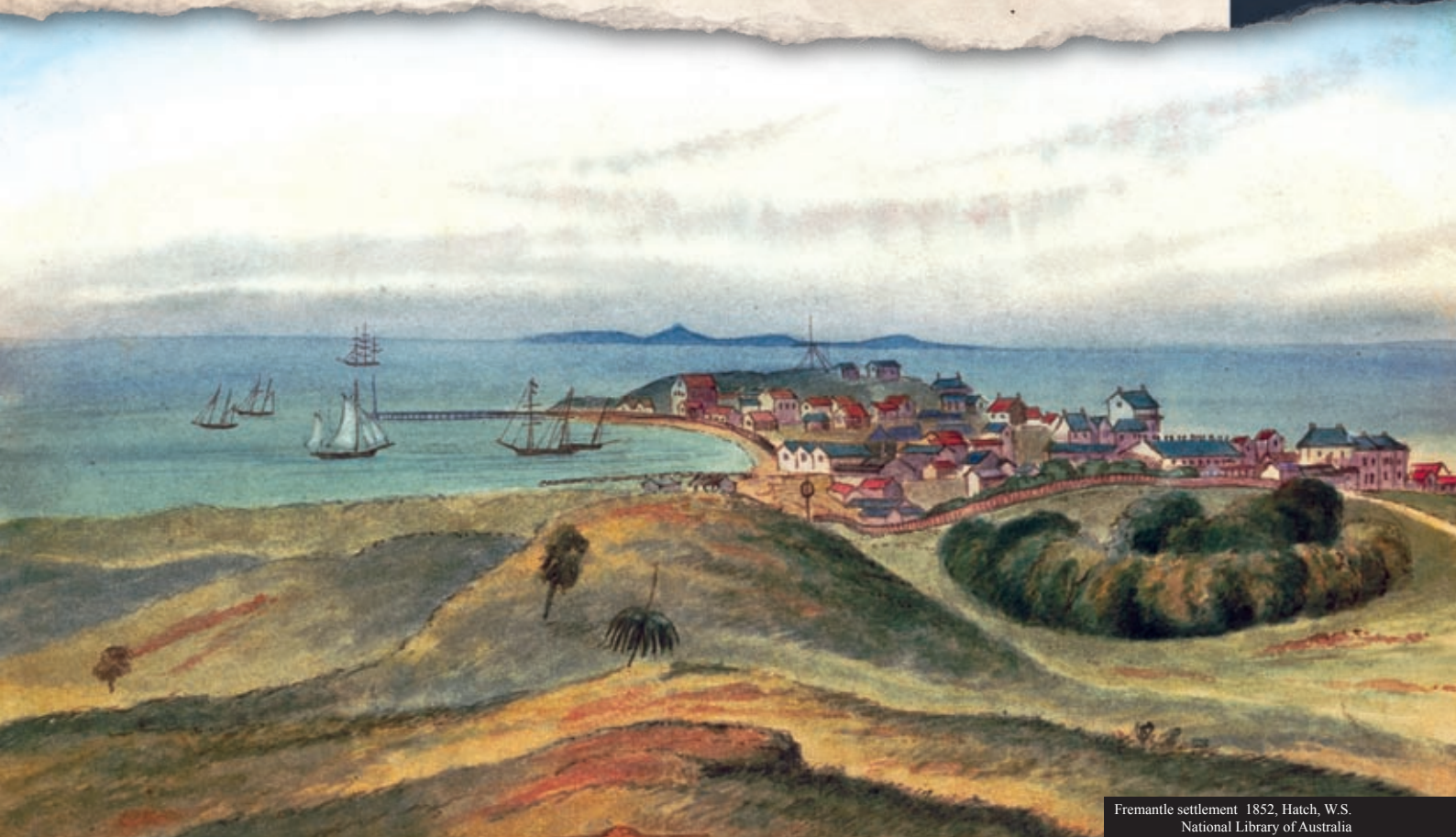
Fremantle settlement 1852