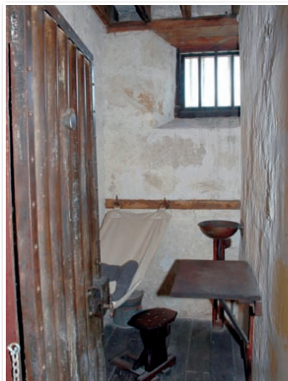
Reconstructed Convict Cell in Fremantle Prison 2009

The questions which follow are designed to encourage your students to think about what daily life would have been like for the convicts.