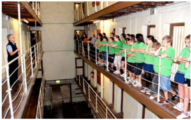
Convict History Tour, Main Cell Block 2008 Fremantle Prison Collection

A sheltered lunch area is available. School bags can be stored in this area.