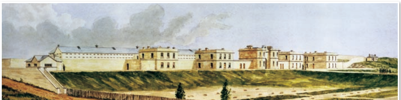
Officers' quarters and guardroom, convict prison, Fremantle 1859