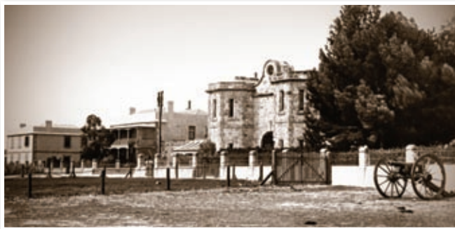
Fremantle Prison Gatehouse with signal cannon in foreground c1870s Fremantle Prison Collection

During and after a visit to Fremantle Prison students will have an opportunity to evaluate and fine tune their escape plans.