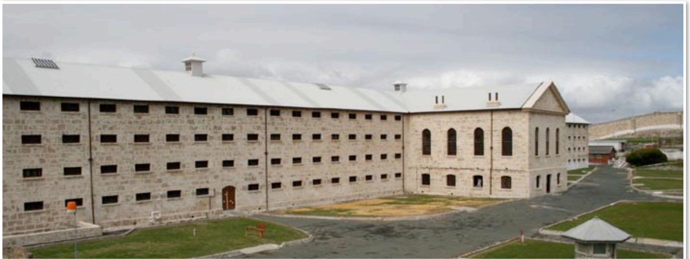
Main Cell Block 2008

The photograph below shows the same view of Fremantle Prison in 2008, 149 years later.